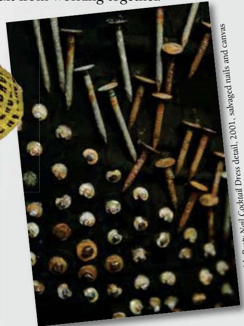
Nancy Judd, Rusty Nail Cocktail Dress detail , 2001, salvaged nails and canvas remnants

Add your words to a participatory sculpture during this drop-in program. All ages draw individualized designs and messages on puzzle pieces and witness the wonders that result from working together.