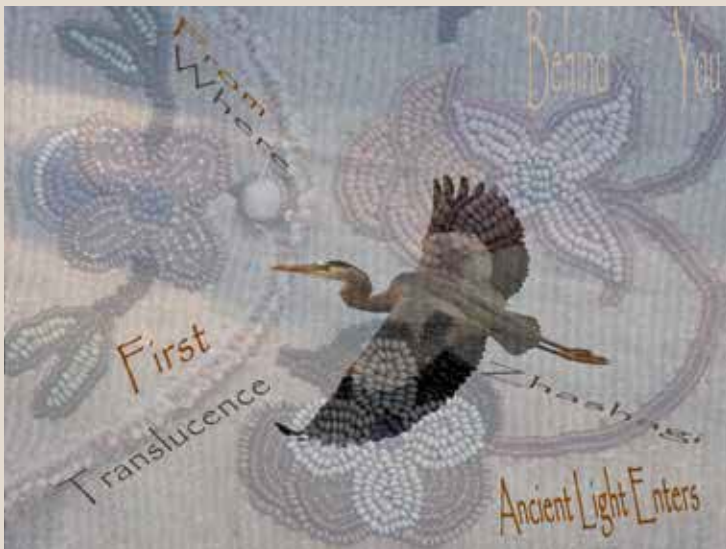
Kimberly Blaeser, Ancient Light , 2014, photograph