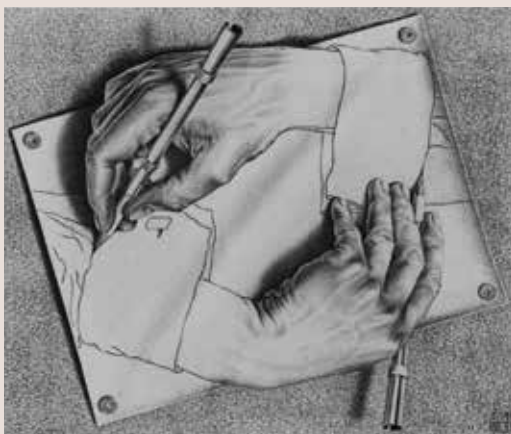
M.C. Escher, Drawing Hands, 1948, lithograph.