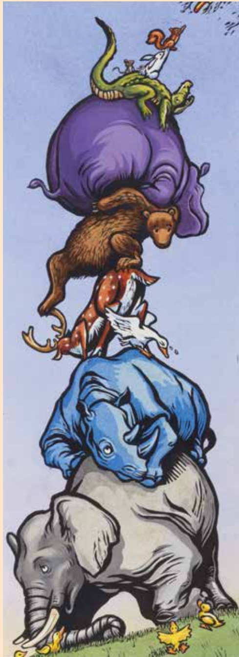
Eric Rohmann, My Friend Rabbit , © 2002 by Eric Rohmann

Using the picture as a guide, fill in the missing letters to spell the names of Rabbit's friends. Follow the airplane trail for clues, as it drags a letter up from one friend to the next.