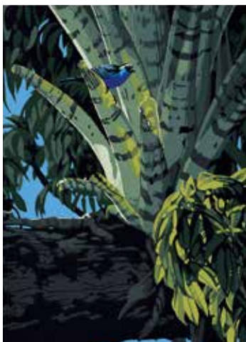
A Jewel in the Crown , 1998