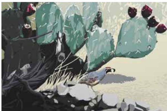
Pas de Deux , 1992