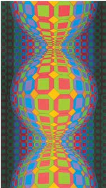
Victor Vasarely, Kaaba II , 1988

The world-renowned father of the Op Art movement, Victor Vasarely (1906-1997) created three-dimensional experiences via two-dimensional artworks featuring bold colors and geometric shapes. Vasarely, whose motto was “art for all,” advocated for democratizing art by producing multiples and screen-prints and by integrating art into architecture and public spaces. Vasarely’s innovative use of optical illusions became popular in the 1960s and 70s, when Op Art permeated everyday life through design, advertisements, and architecture. His artwork exploring visual perception and spatial relationships is a source of inspiration for those interested in art, computer programming, architecture, and beyond. From the collection of Herakleidon Museum in Athens, Greece, and organized by PAN Art Connections, Inc. , this One Source Traveling Exhibition comprises more than 150 Vasarely serigraphs, lithographs, gouache paintings, and drawings.