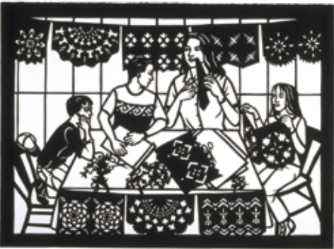
Carmen Lomas Garza, Haciendo Papel Picado/Making Paper Cutouts , 1998

To transform paper, rubber, metal, and more into thought-provoking artworks, artists explore varied piercing and cutting techniques that provide endless possibilities for change. Cutting into and through surfaces, artists alter items from opaque to transparent, flat to sculptural, rigid to delicate, and ordinary to exquisite. The process and precision required are laborious, technically demanding, and always astonishing. The art of paper cutting dates back thousands of years, with early artwork emerging from sixth-century China, extending worldwide by the fourteenth century, and later sparking a wave of folk-art traditions. Celebrating both innovation and tradition, this exhibition features the work of more than fifty artists, representing diverse styles, techniques, and sizes from three-inch artworks to sprawling, complex installations. Cut Up/Cut Out was organized by Carrie Lederer, curator of exhibitions, Bedford Gallery, Leshner Center for the Arts, Walnut Creek, California.