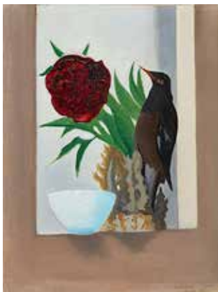
Joseph Stella, Bird with Blue Bowl , ca. 1915