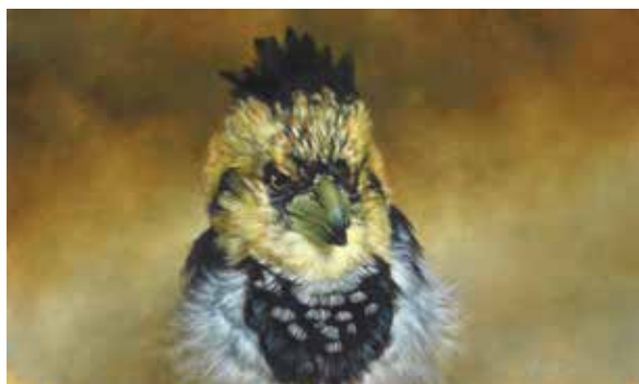
Edward Aldrich, Crested Barbet , 1997

Regal Bearing applies the tenets of portraiture to more than sixty artworks from the Museum's collection. As with human portraits, the artists represented captured the essence of their subjects using a variety of formats, including a focus on single birds without backgrounds as well as the inclusion of habitat or attributes that help to characterize a species or place it in context.