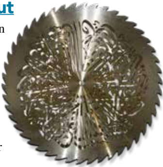
Mounir Fatmi, Between the Lines , 2010

A contemporary take on the ancient, yet ever-evolving, art of cutting paper comprises a range of techniques and materials – from vintage maps and magazines to a leaf, car tire, and saw blade.