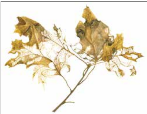
© Lynne Railsback, Oak Leaf Lace , 2017

native plants. Familiar plants such as sunflowers and violets and rare species such as lady's slipper orchids are highlighted in watercolors and other mediums. Botanical Art Worldwide: America's Flora is part of a worldwide project in which national exhibitions are simultaneously on view at cultural institutions in twenty-five countries on six continents. Each exhibition features contemporary artwork of native plants by resident artists via a coordinated, international effort to increase appreciation of the world's plant diversity and to link people with plants via botanical art.