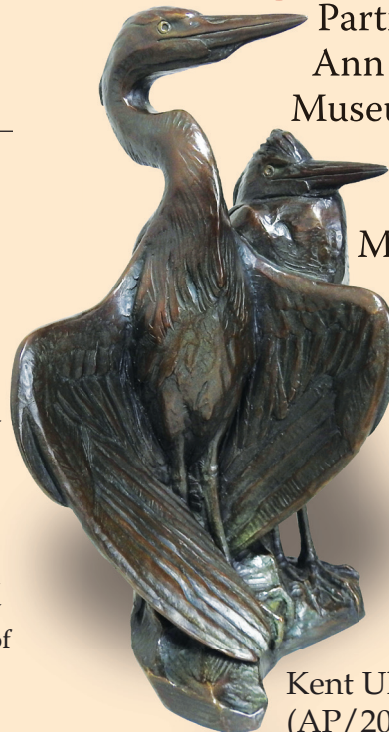
Kent Ullberg, Great Blue Heron (AP/20), bronze

Anderson for a guided introduction to the Museum's new tactile art exhibition, In Touch with Art .