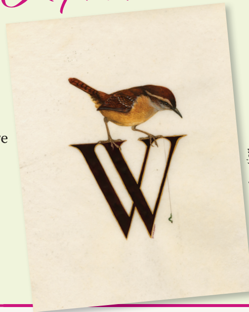
W, the Wren in perpetual motion