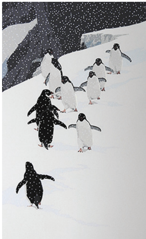
Anne Senechal Faust, Cold Wind from the South , 1990, serigraph