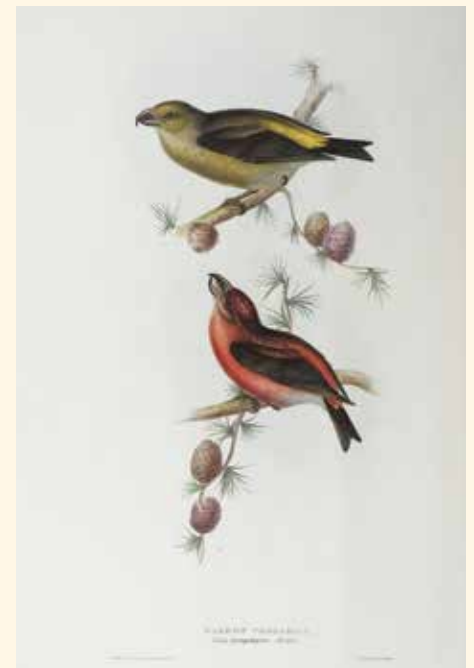
John Gould and Elizabeth Gould, Parrot Crossbill , 1832-37, hand-colored lithograph on paper