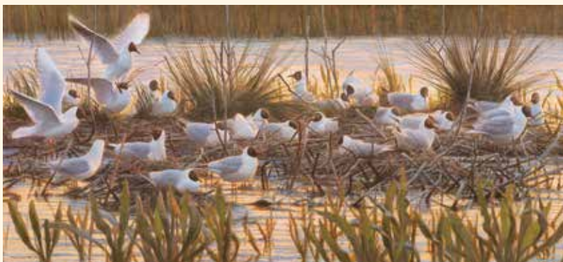
Elwin van der Kolk, Evening Light , 2012, acrylic on hardboard