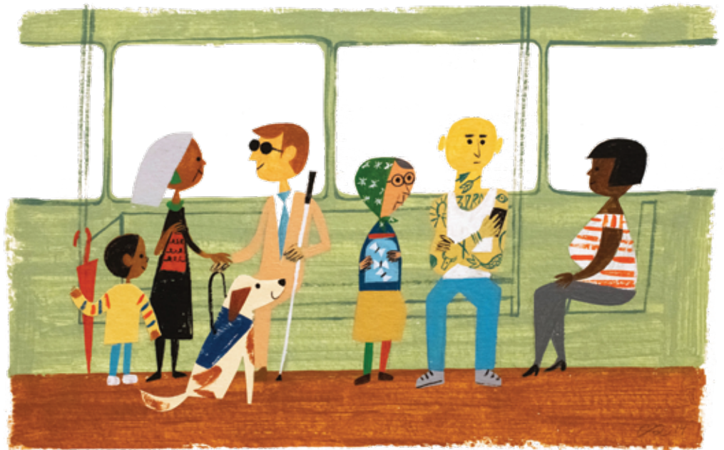
Christian Robinson, Last Stop on Market Street , © 2015, acrylic on paper

Activity Guide Explore exhibition themes and ideas for creative conversation and making, free, in print and online.