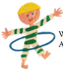
Above: Christian Robinson, Another (detail), © 2019, acrylic paint and collage on paper