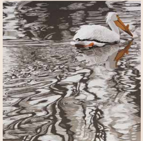
Top, from left: Frederick O'Hara, Picador , 1959, color woodcut on Japanese paper; Jim Dine, Fourteen Color Woodcut Bathrobe , 1982, color woodcut on wove paper