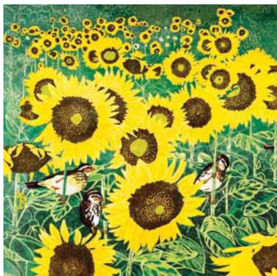
Sunflowers and Sparrows, 2005 (detail)