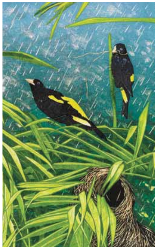
Cacique, 1996 (detail)