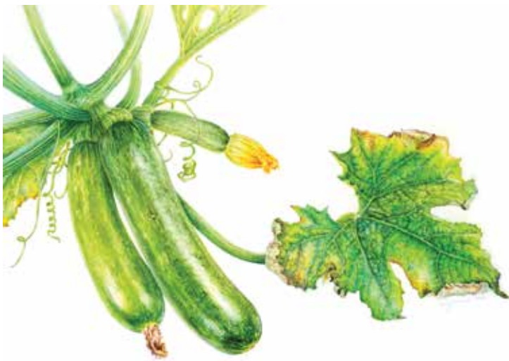
© Seongweon Ahn, Fordhook Zucchini , 2020, colored pencil on paper

Individuals with low vision or blindness explore botanical artworks on view via a multisensory experience with Museum educators followed by guided art making in the Museum's classroom. Call 715.845.7010 to register.