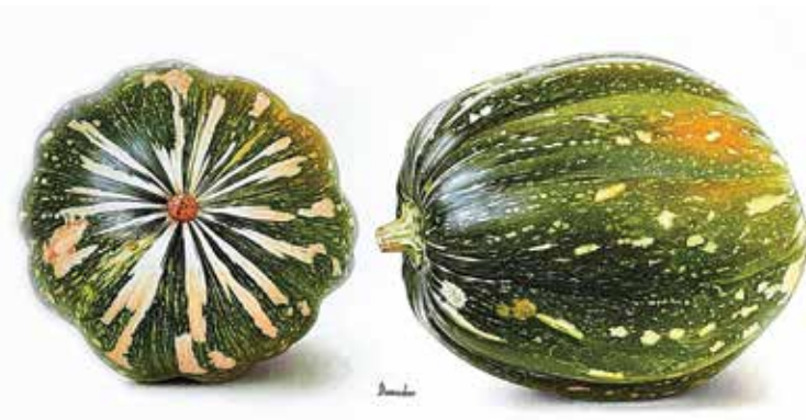
© Damodar Lal Gurjar, Pumpkin , 2020, tempera on paper

The Woodson's sculpture garden serves as a drop-in sculpture studio for children and families to experiment with various materials, including wire, wood, and clay, to create small-scale sculptures.