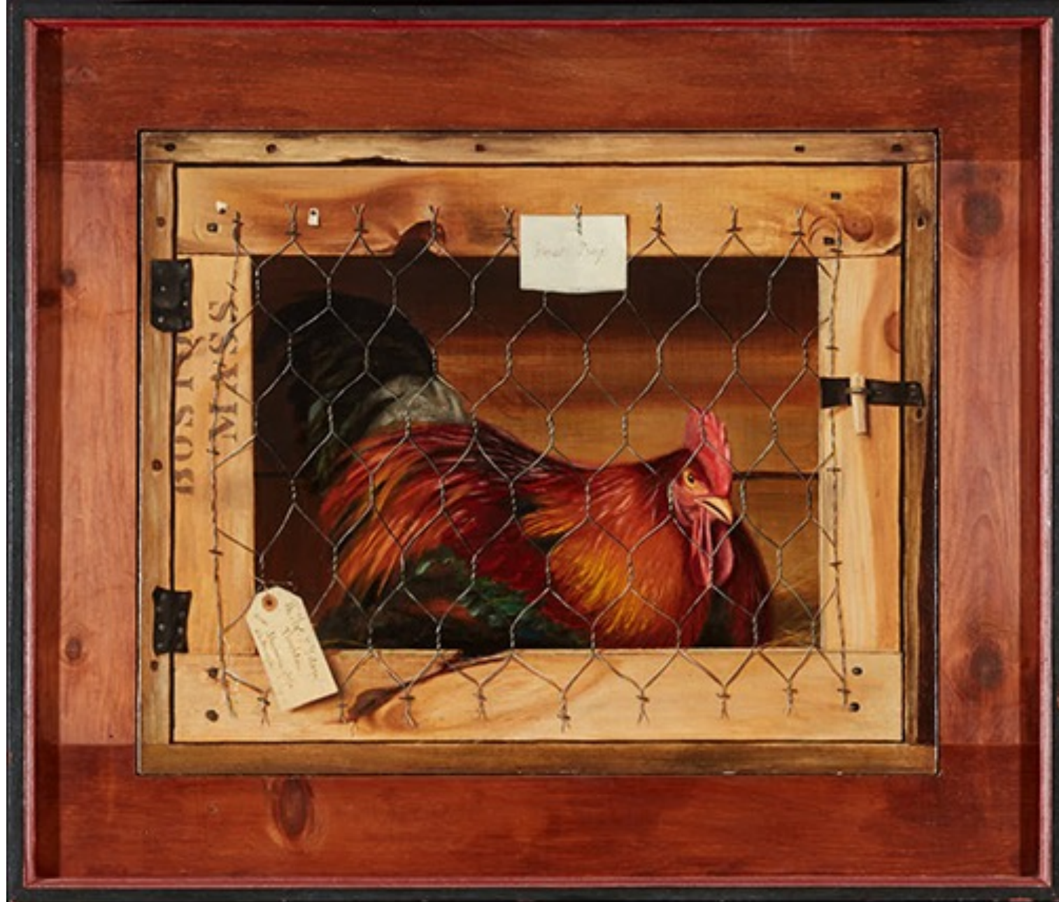
Alexander Pope, Jr., First Prize , ca. 1890, oil on canvas, Museum purchase with funds provided by the Nancy Woodson Spire Foundation