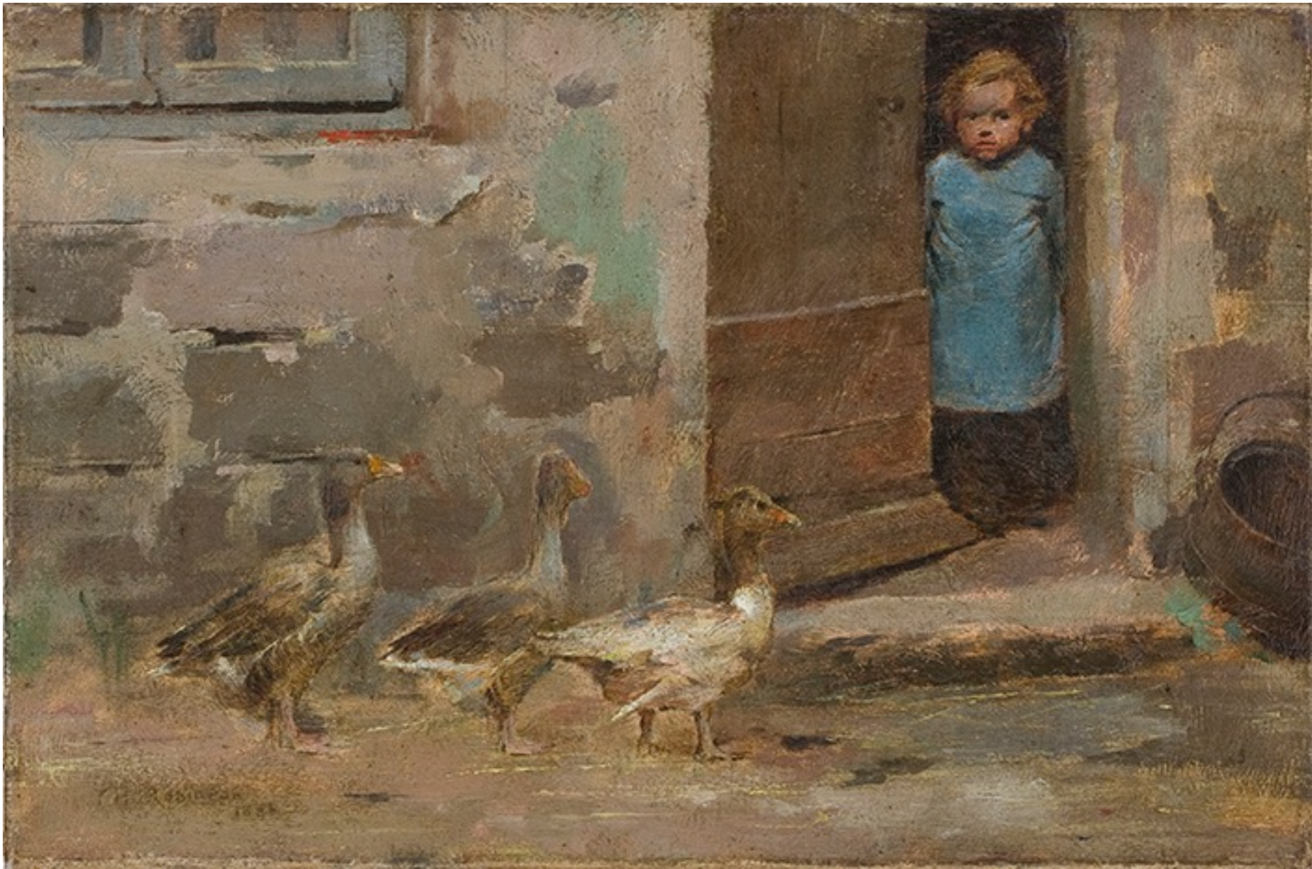
Theodore Robinson, Child with Geese , 1886, oil on canvas, Museum purchase with funds provided by the John and Alice Forester Charitable Trust