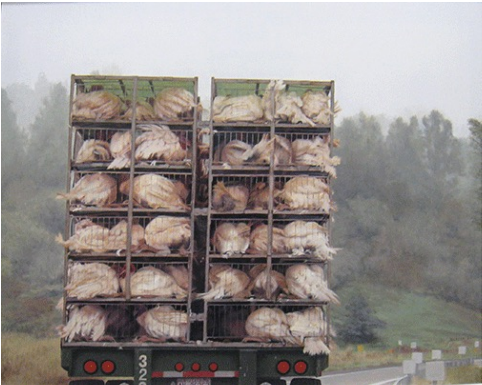
Sally Berner, Happy Thanksgiving , 2000, oil on canvas, gift of the artist