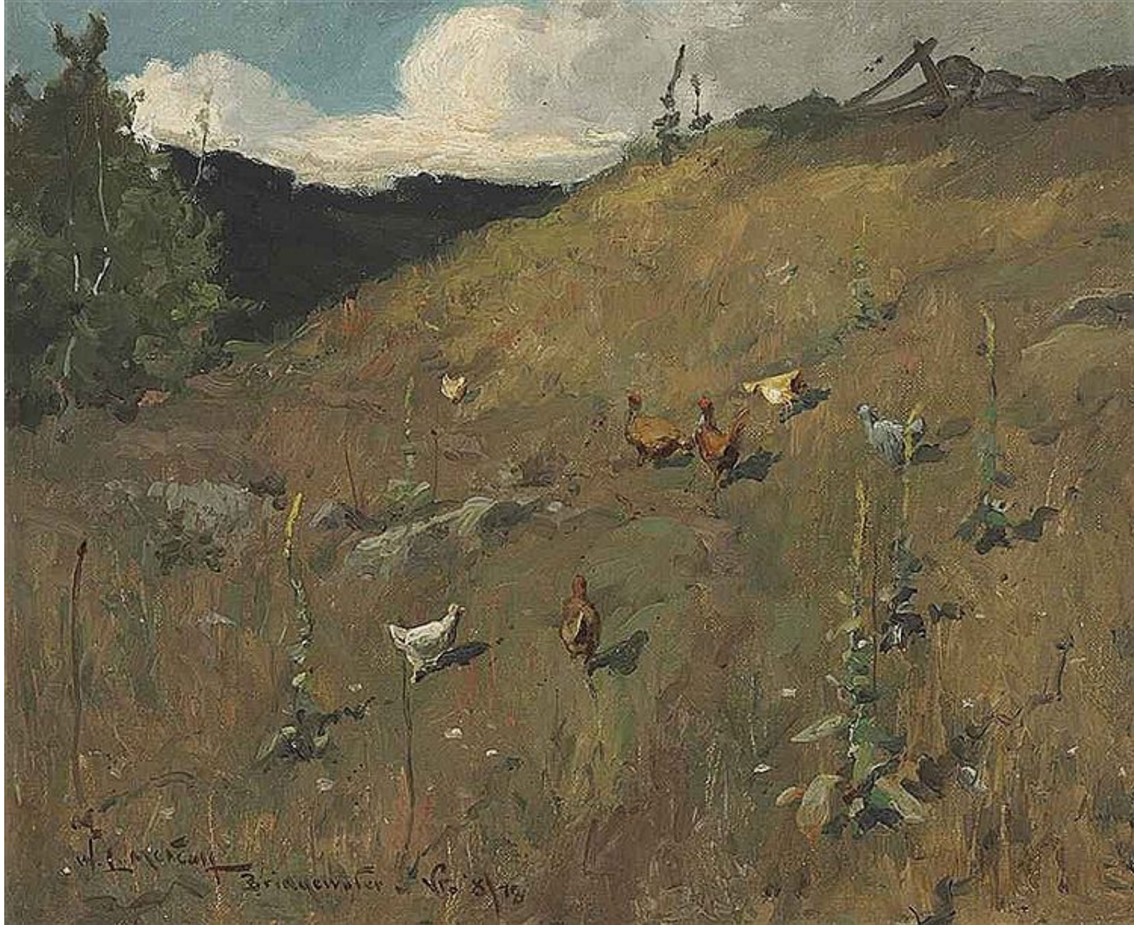
Willard L. Metcalf, Landscape with Chickens , 1878, oil on canvas, Museum purchase with funds provided by the Nancy Woodson Spire Foundation