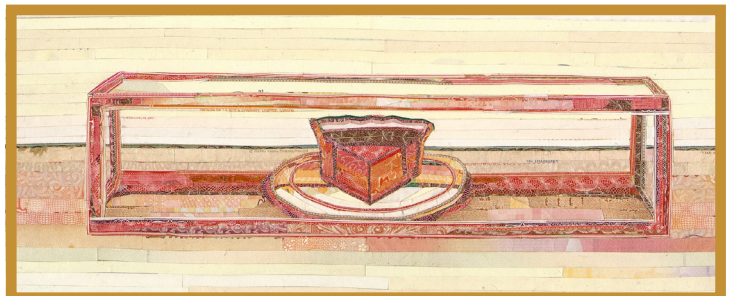
(LEFT) C.K. Wilde, Cash Cow-Sacred Chao-We Are What We Eat , 2009, currency collage; (UPPER RIGHT) C.K. Wilde, Self Portrait , 2003, currency collage; (LOWER RIGHT) C.K. Wilde, The Last Piece of Pie (After Wayne Thiebaud) , 2011, currency collage

Stroll the Cultural Currency galleries with C.K. Wilde as he highlights favorite artworks and shares insights from the perspective of an artist making from money.