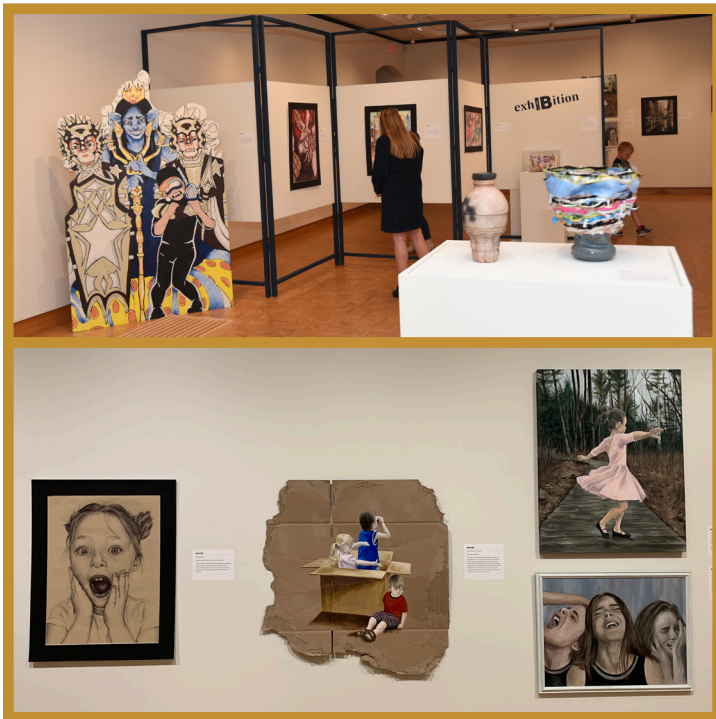
(LEFT COLUMN) Installation view, exh-IB-ition , 2022, featuring artwork by Wausau East High School students; (RIGHT COLUMN, counterclockwise) Millard Sheets, Enchanted Island , 1978, acrylic on canvas; Leonora Carrington, The Saints of Hampstead Heath , 1997, oil and gold leaf on canvas board; Stowe Wengenroth, House at Port Clyde , 1938, lithograph

Wausau East High School International Baccalaureate (IB) art students collaborate with Advanced Placement (AP) art students from Wausau West to present highlights from their respective art portfolios, the result of rigorous program curricula.