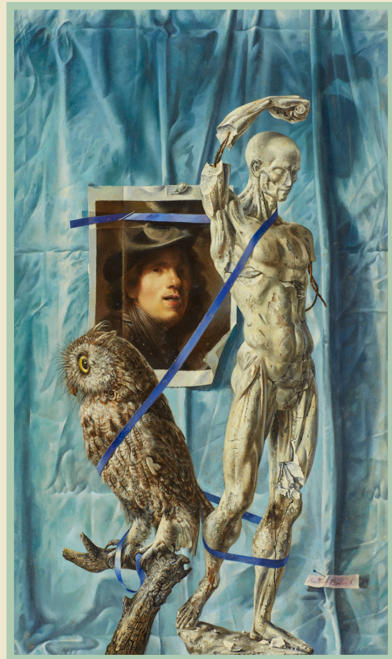
(LEFT) Ajay Brainard, Craving the Warmth of Your Touch , ca. 2013, oil on panel; (ABOVE) Aaron Bohrod, Still Life with Rembrandt , 1958, oil on gessoed hardboard; (BELOW) Fidelia Bridges, Birds by the Shore (detail), 1873, watercolor and gouache on paper on illustration board