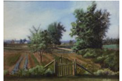
Above: Owen Gromme, Gate , 1927, oil on canvas