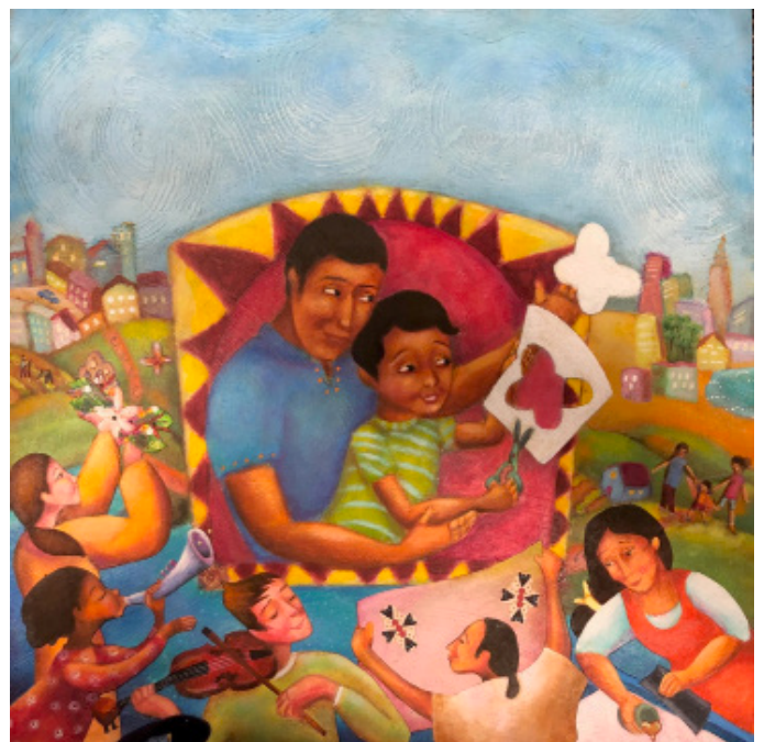
Yuyi Morales, Todos Buenos Manos , acrylic on paper

Contact the Museum at 715.845.7010 or scheduling@lywam.org to learn more and plan your residency visit.