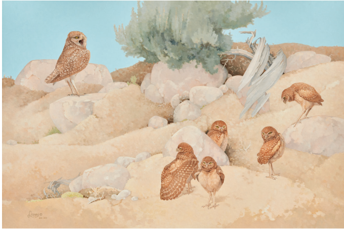
Laney, Prairie Family , 2023, oil on gessbord

Birds inspire us in endless ways through flight, beauty, and delightful mannerisms. Artists around the world push themselves to new heights, hoping to be selected for the internationally renowned Birds in Art exhibition. The 48th annual exhibition celebrates avian wonders through fresh interpretations in original paintings, sculptures, and graphics created in the last three years.