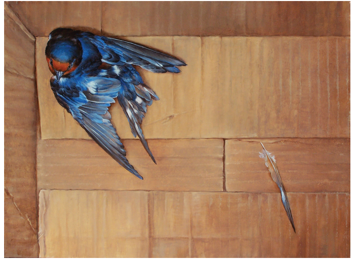
Aleta Steward Rossi, Disintegration , 2020, oil on gessobord

Celebrate Youth Art Month and the creative efforts of central and north central Wisconsin students in grades 9 - 12 via the 47th annual Student Art Exhibition . Each March, the nation promotes art education by focusing on and highlighting student work. The exhibition is open to art educators teaching in public, parochial, and home schools in central and north central Wisconsin.