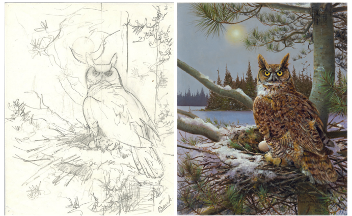
Left: Owen J Gromme, Composition Sketch for Early Nester , 1968, pencil on paper