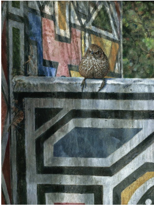
Jenny Hyde-Johnson, Impangele , 2013, acrylic on canvas

A Civic Wilderness invites you to reflect on the intricate relationship between the urban and the natural. Featuring 40+ artworks the Museum's permanent collection, artworks here capture the poetic juxtaposition of nature's persistence against the backdrop of human intervention. Through the eyes of artists, we see the city not as an antagonist to nature, but as a canvas for creative integration. This exhibition celebrates the beauty of this coexistence and challenges us to consider our role in preserving and nurturing the delicate balance between the two worlds. Throughout, artworks: explore the transformation of pockets of the urban environment into urban oases offering respite from the 'concrete jungle;' emphasize the presence of birds, insects, and other creatures that thrive amidst the hustle and bustle of city life, reminding us of the diversity that exists even within the urban sprawl; and depict how the city is a dynamic canvas in its own right.