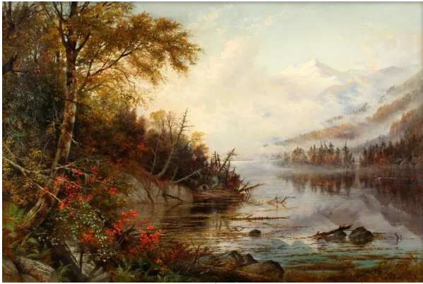
Susie M Barstow, Mountain Lake in Autumn , 1873, oil on canvas

This exhibition will celebrate the art, creative practice, and vision of women artists engaged with American landscape in the nineteenth century and today. Through the presentation of diverse and multigenerational perspectives, creative practices, and critical conversations, this exhibition will expand our understanding of the many women creating art about land and landscape. Women Reframe American Landscape also redefines how we understand the history and artistry of the Hudson River School and expands our understanding about our relationship to landscapes today.